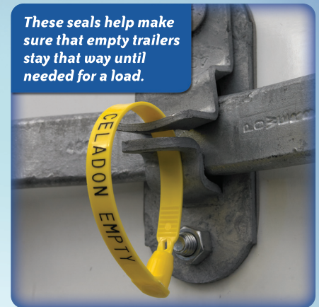
These seals help make sure that empty trailers stay that way until needed for a load.

Celadon Trucking Services is one of North America's largest full truckload carriers, operating in the U.S., Canada and Mexico. Founded in 1985, they are headquartered in Indianapolis, IN.