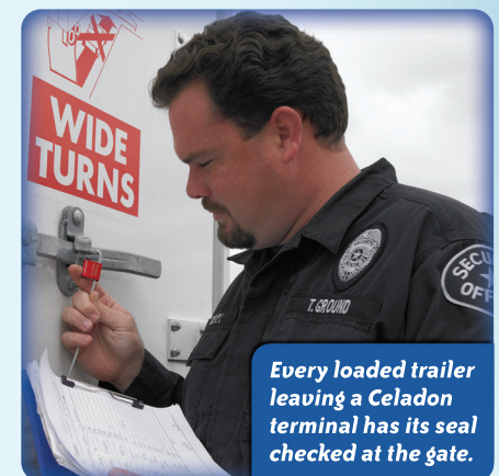
Every loaded trailer leaving a Celadon terminal has its seal checked at the gate.

“We're loyal to J. J. Keller because they've proven their loyalty to us, time and time again. I'm proud to recommend them to my colleagues in the industry. I know that they'll experience the same good quality products, good prices and good people that we do. Why go anywhere else?”