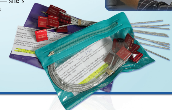
Celadon drivers are given convenient packets of consecutively numbered seals to use for their next 10 loads.